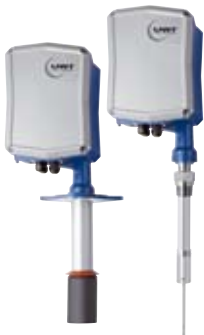
NB 3100 Rope version