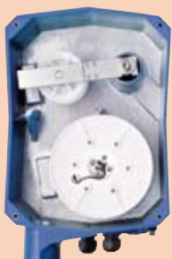
View rope/tape chamber